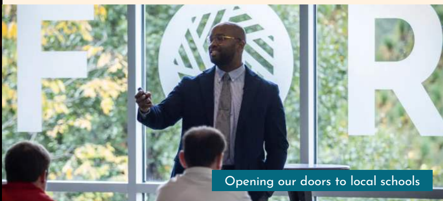
Opening our doors to local schools

When we accept the call from God to be on mission for our community, we have the potential to make a generational impact.