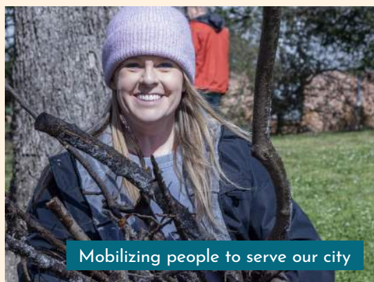
Mobilizing people to serve our city

Visit MountaintopChurch.com/FORBHM to learn more about outreach initiatives.