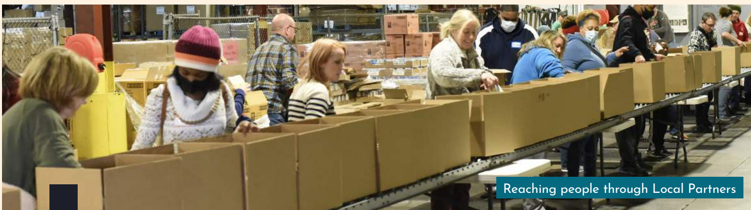
Reaching people through Local Partners