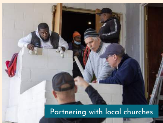
Partnering with local churches

Your generosity makes it possible to serve local schools and provide monthly support to amazing local & global partners who share God's love in tangible ways by combating global poverty, assisting families in crisis, helping those stuck in addiction and rallying around the most vulnerable in our community.